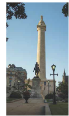
Baltimore is also known as the Monumental City.

Ortle Park at Camden Yards and a trip on the Charm City Canalboat to one of several local neighborhoods, such as Harbor East or Little Italy for browsing, shopping and dining options for all budgets. You can also head to the Inner Harbor for a walk with the Inner Harbor Historic Foundation. Other points of interest close to the Convention Center and Inner Harbor include the National Aquarium, the Maryland Science Center, and the American Veterinary Art Museum. By land or by sea, we hope you enjoy the meeting and take time to discover what makes Baltimore so charming! I. Smaller U. How the city's nickname came to be. Baltimore Sun 1995 Jul 14