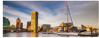
Baltimore's Inner Harbor waterfront is a beautiful walk west from the Baltimore Convention Center.

It's great to be back in Baltimore for the 2016 ASHP Summer Meetings, a perfect blend of learning and networking. We are so glad you could join us. This week, you'll be able to choose from four concurrent specialized meetings: Ambulatory Care Conference, Informatics, Medication Safety Collaborative, and Pharmacy Practice & Policy. No matter which program you've selected, you'll also have unrestricted access to all of the sessions and events taking place at the other meetings.